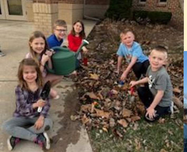
Godly Play and Connect students planting pansies March 13.

March 20 visit from the Isaacson family donkey — looking forward to Palm Sunday.