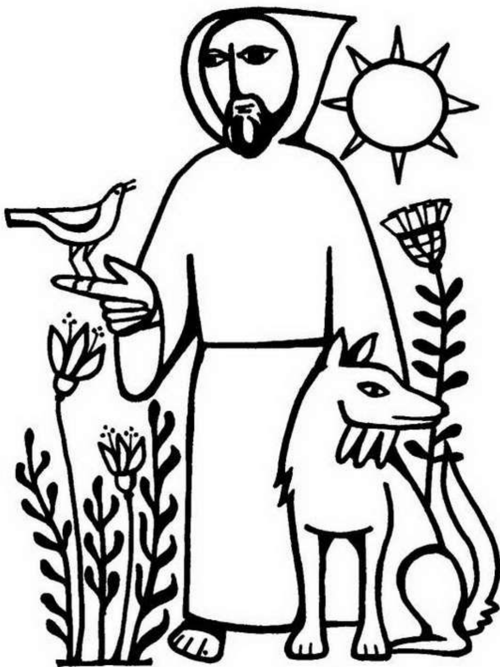
St. Francis blesses all the animals of the world