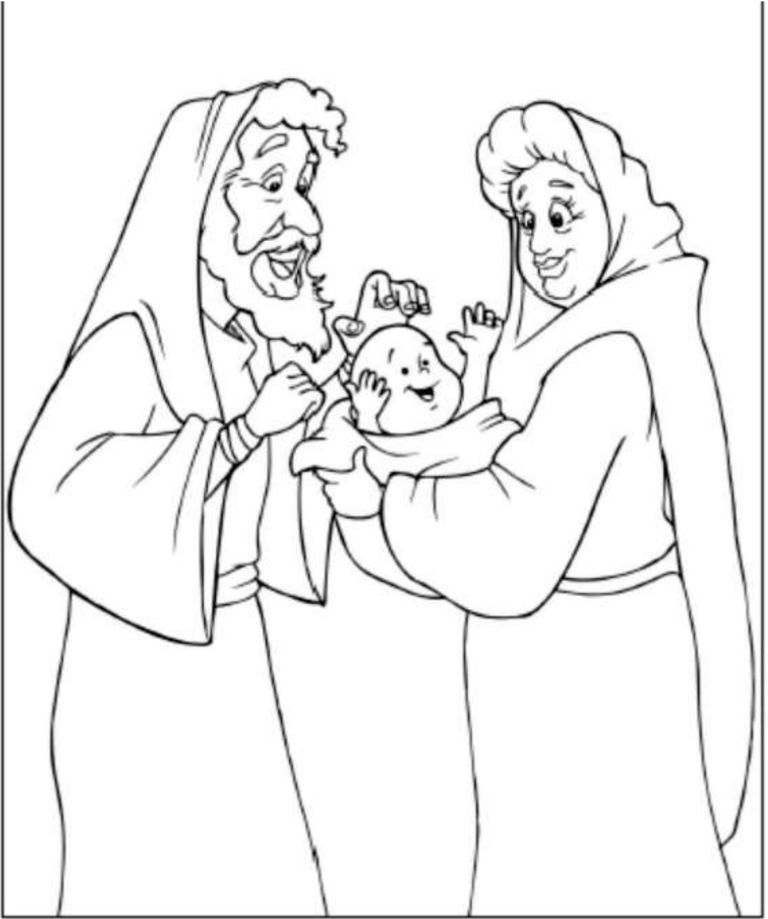
Abraham and Sarah