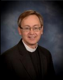
From the P astor

Jesus, the sinner's Friend, to Thee, Lost and undone, for aid I flee, Wearied of earth, myself, and sin; Open Thine arms, and take me in.