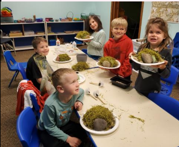
Above: Making empty tombs at Easter.